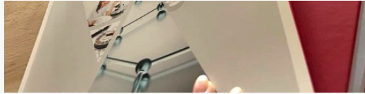
Business trip to L'Oréal