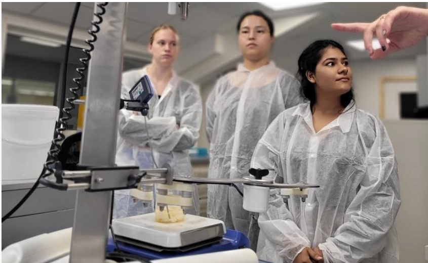
Food & wine with the participants and organisers.