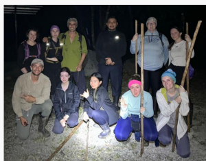
Night Walk in Veragua Rainforest

One of my most memorable moments was challenging ourselves during a night walk in the Veragua Rainforest, where we saw a variety of species from snakes and bats to tarantulas and frogs. The highlight was turning off our flashlights and absorbing the sounds around us, which made me realize there's so much more to life than I had imagined.