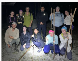
Night Walk in Veragua Rainforest

One of my most memorable moments was challenging ourselves during a night walk in the Veragua Rainforest, where we saw a variety of species from snakes and bats to tarantulas and frogs. The highlight was turning off our flashlights and absorbing the sounds around us, which made me realize there's so much more to life than I had imagined.