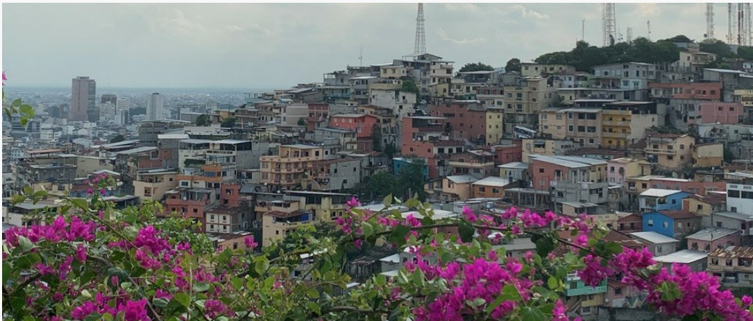
Colorful buildings in Guayaquil, Ecuador.

Ecuador has become one of the most favourite places I have ever visited. The people are welcoming, the weather was perfect and the food was delicious. This trip highlighted some places I want to return to one day and it was overall an amazing time. I tried many new foods for the first time, like the famous dish "Tigrillo", crab, and cocoa plant fruit. I also had a great time shopping and buying souvenirs and handcrafted goods from locals, like jewellery made from palms or alpaca wool blankets.