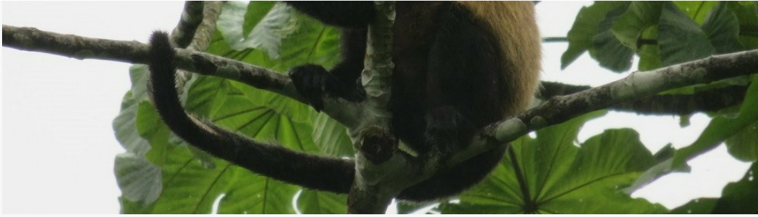
A photo of a howler monkey in its natural habitat.

Ecuador has become one of the most favourite places I have ever visited. The people are welcoming, the weather was perfect and the food was delicious. This trip highlighted some places I want to return to one day and it was overall an amazing time. I tried many new foods for the first time, like the famous dish "Tigrillo", crab, and cocoa plant fruit. I also had a great time shopping and buying souvenirs and handcrafted goods from locals, like jewellery made from palms or alpaca wool blankets.